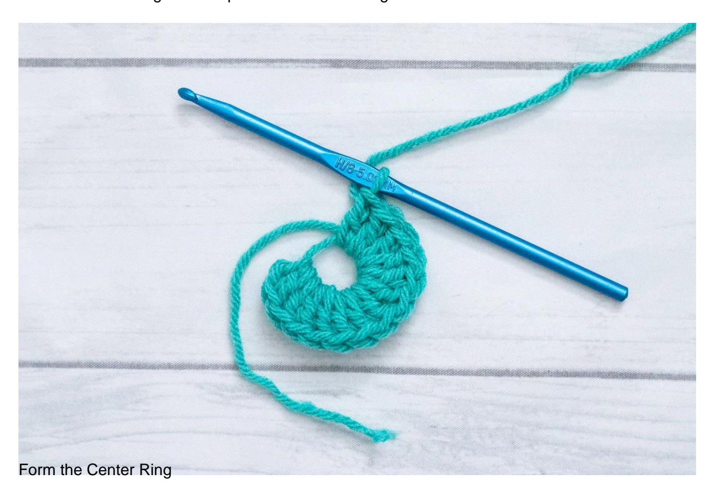
Round 1: Commence by chaining two, which counts as the first double crochet. Proceed to double crochet fifteen times into the center of the ring. To complete the round, employ a slip stitch to connect to the top of the initial chain. (Total: 16 stitches)

To begin crafting your sunburst granny square, initiate it with a magical ring or by chaining four and then connecting with a slip stitch to create a ring.