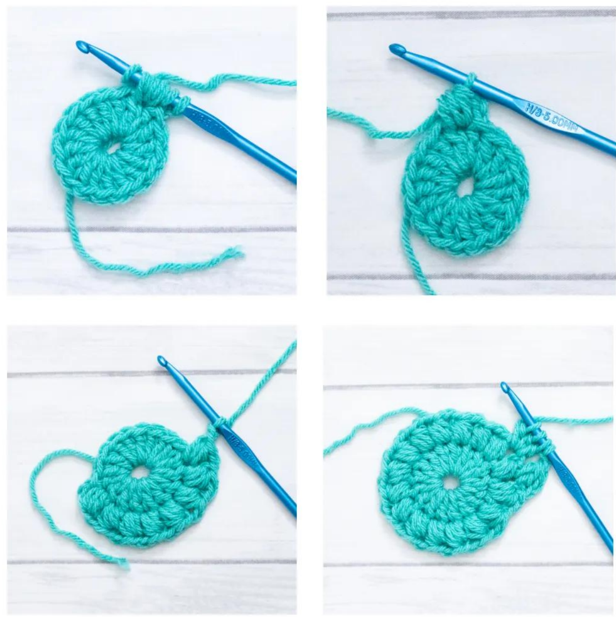
Create the First Round