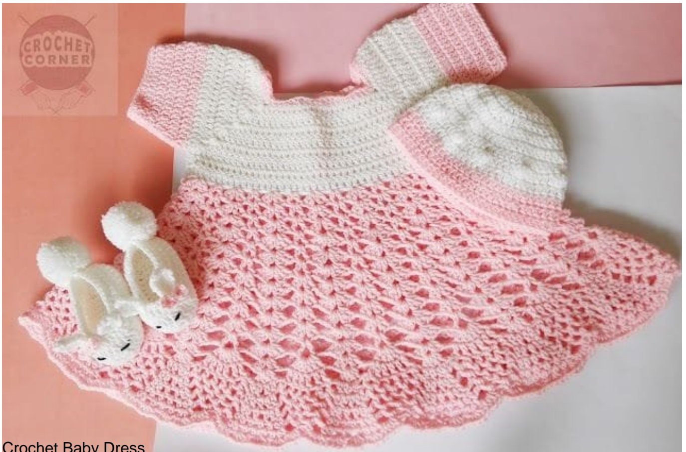
Crochet Baby Dress

The creation of a delicate crochet baby dress is a labor of love. With each stitch, you are contributing to a piece of artistry that will adorn your baby in elegance. Watching the dress slowly take shape is a fulfilling experience, and knowing that it's a unique, handcrafted garment imbued with love makes it all the more special.