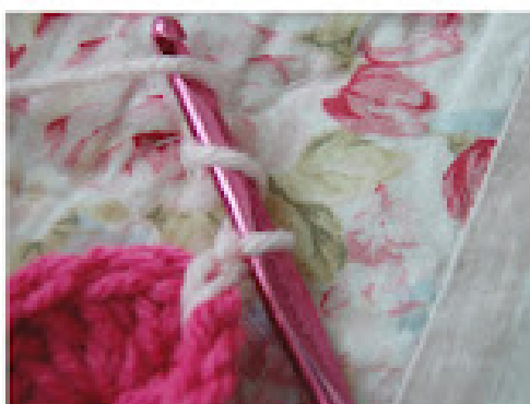
Round 1 daisy