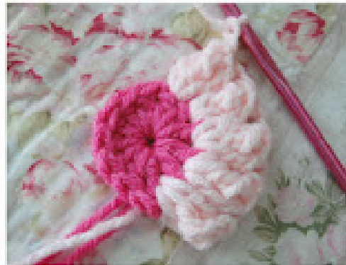
Round 2 daisy

For those inquiring about the border addition to the daisy square, I've provided some illustrative photos below to guide you through the process.