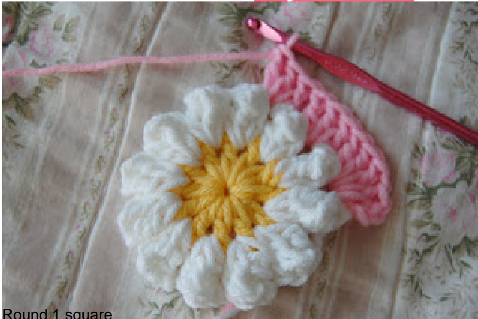
Round 1 square

In the following space: Make 3 double crochets, chain 1, and 3 more double crochets to form the next corner.