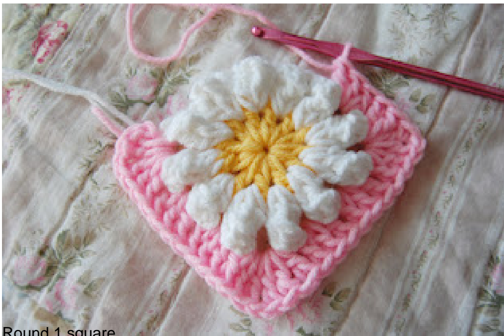
Round 1 square

In the following space: Make 3 double crochets, chain 1, and 3 more double crochets to form the next corner.