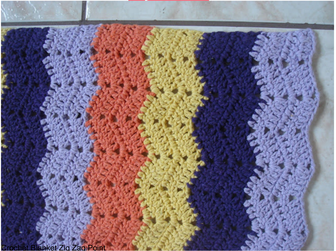
Crochet Blanket Zig Zag Point

Follow along with our comprehensive step-by-step guide and detailed diagrams to master the art of creating stunning zig zag designs.